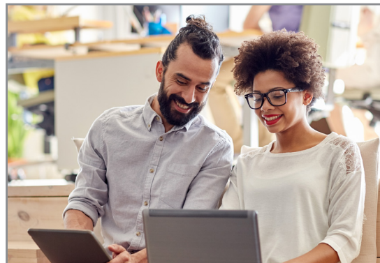
Figure 2 Gain Private Cloud Success with Cisco UCS Director and FlashStack

FlashStack is integrated with Cisco UCS Director through the Pure Storage FlashArray adapter for Cisco UCS Director. This adapter helps simplify the automation of FlashStack deployments and management tasks throughout the stack, including workflows for computing, fabric, and storage components. The adapter includes a variety of pre-automated tasks that can be connected to form complex workflows throughout the system. The adapter also includes a set of pre-built workflows to automate common actions and to serve as templates for the automation of subsequent actions when necessary. Also included in the Pure Storage FlashArray adapter also includes several report views that provide visibility into aspects of the FlashStack architecture: hosts, volumes, etc.