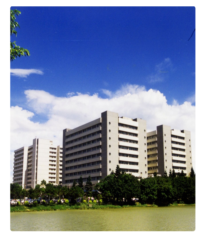
CHANG GUNG MEMORIAL HOSPITAL (CGMH), the largest medical center in Taiwan