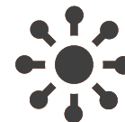
Management & Control