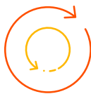
Backup & Restore