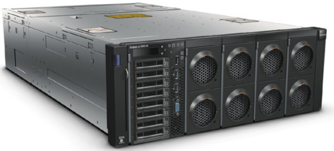
FIGURE 3. System x3850 X6

With Intel Xeon E7 v4 technology, the x3850 X6 delivers fast application performance, an agile system design, and a resilient platform for mission-critical databases, enterprise applications, and virtualized environments.