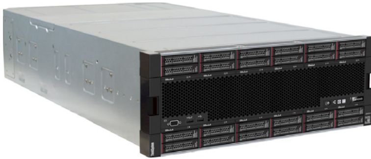
FIGURE 1. Lenovo ThinkSystem SR950

The SR950 packs numerous fault-tolerant and high-availability features into a high-density, 4U rack-optimized design. Detailed technical information is available online in the Lenovo Press SR950 Product Guide .