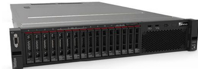
FIGURE 2. Lenovo ThinkSystem SR650

The Lenovo ThinkSystem SR650 is a 2-socket 2U rack server for smaller SAP environments such as test, development, or small production environments. It can be equipped with up to two of the latest generation Intel Xeon Scalable family processors and up to 3 TB of main memory in 24 DIMM slots.