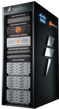
FlashStack with Pure Storage FlashArray™ products for scalable, high-performance, all-flash infrastructure