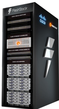
FlashStack with Pure Storage FlashBlade™ products for data warehousing, analytics, or artificial intelligence (AI)